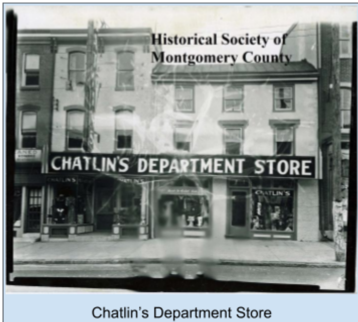
Chatlin's Department Store