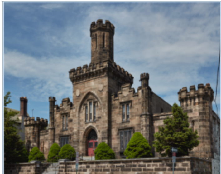
The Old Montgomery County Prison.