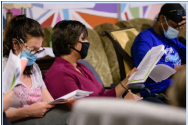
Community members and professional actors read the script-in-progress at Hopeworx.

Community members and professional actors