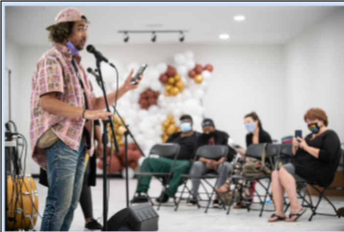
ILL DOOTS performs for community members at THE TOWN HOLLA: A Norristown Open Mic Night.