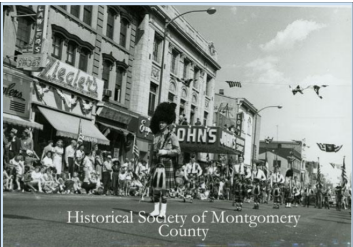
The big parade on Main Street during the Sesquicentennial in 1962.