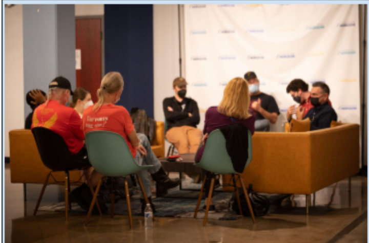
Community members participate in a group story circle with the creative team.

Creating a new play requires collaboration between a dedicated creative team of theatre artists—including a director, playwright, composers, and designers—and Norristown community members like YOU.