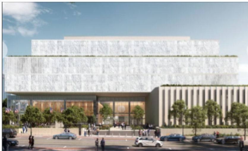
The Montgomery County Justice Center, which will be ready in 2026.

Mills - As a center for industry, Norristown has and had many mills throughout the area.