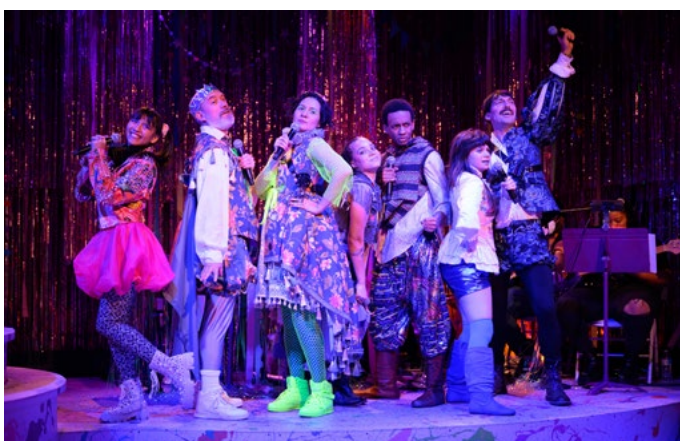
The cast of Head Over Heels.

In February, the hilarious, queer musical comedy, Head Over Heels , had audiences tapping their heels and jamming out to iconic Go-Go's hits like "We Got the Beat" as we watched the royal family of Arcadia attempt to save their kingdom...and find love and acceptance along the way.