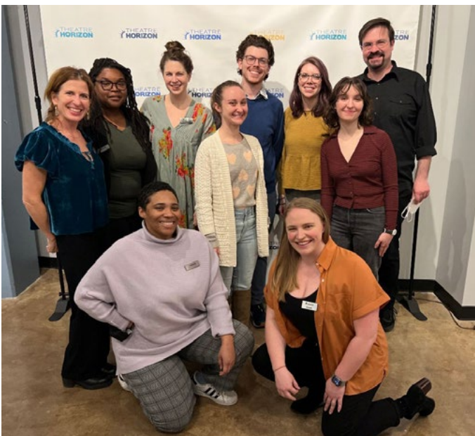
Staff members on opening night of Head Over Heels