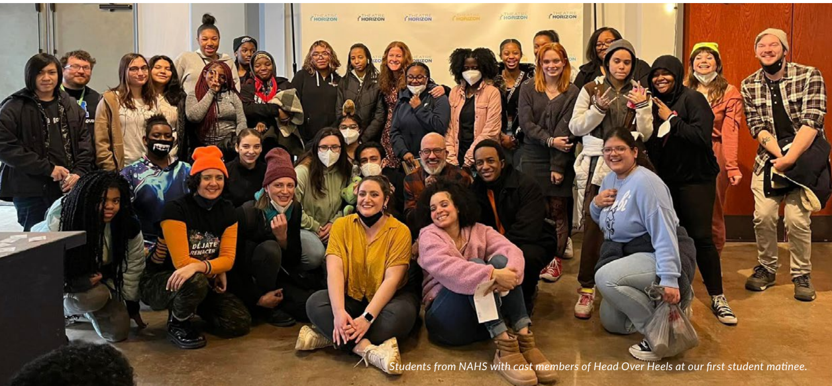
Students from NAHS with cast members of Head Over Heels at our first student matinee.