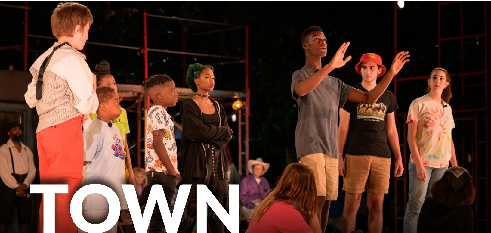
Youth Chorus of TOWN.