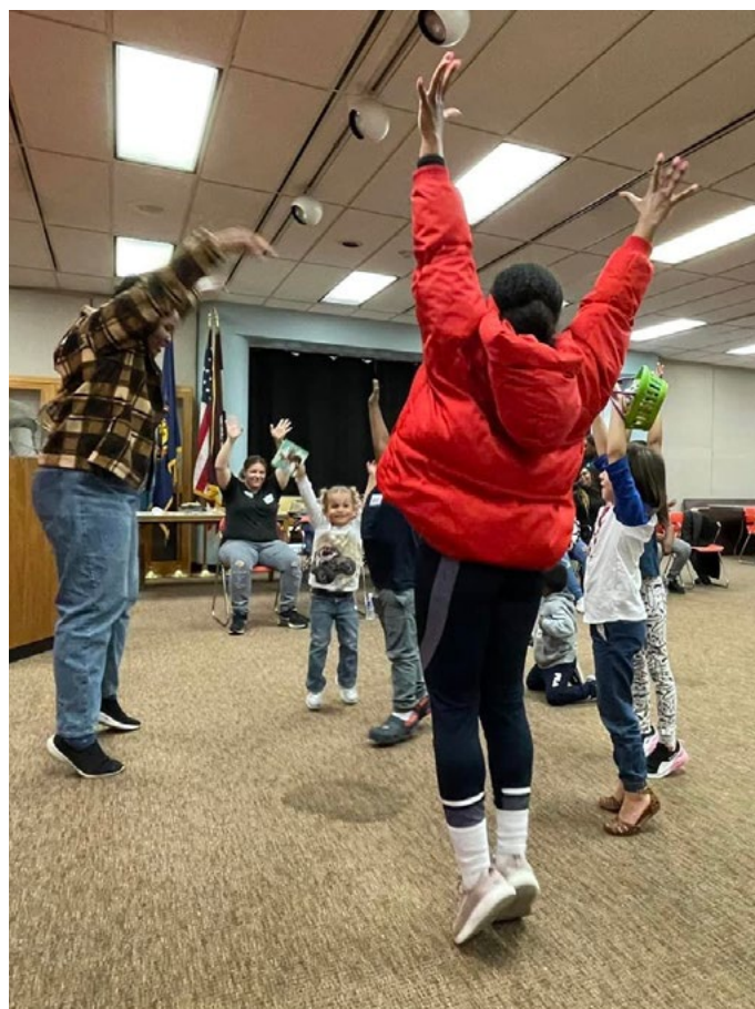
Theatre Horizon teaching artists lead a game with students at Norristown Public Library

This year, we have continued to have a presence at community spaces and events in Norristown. Our partnership fostered during the creation of TOWN with the Norristown Public Library and a new partnership with the Norristown Literacy Council and One Book One Norristown led to a theatrical literacy event at the library. Students read a magical book and played theatre games that helped bring the story to life.