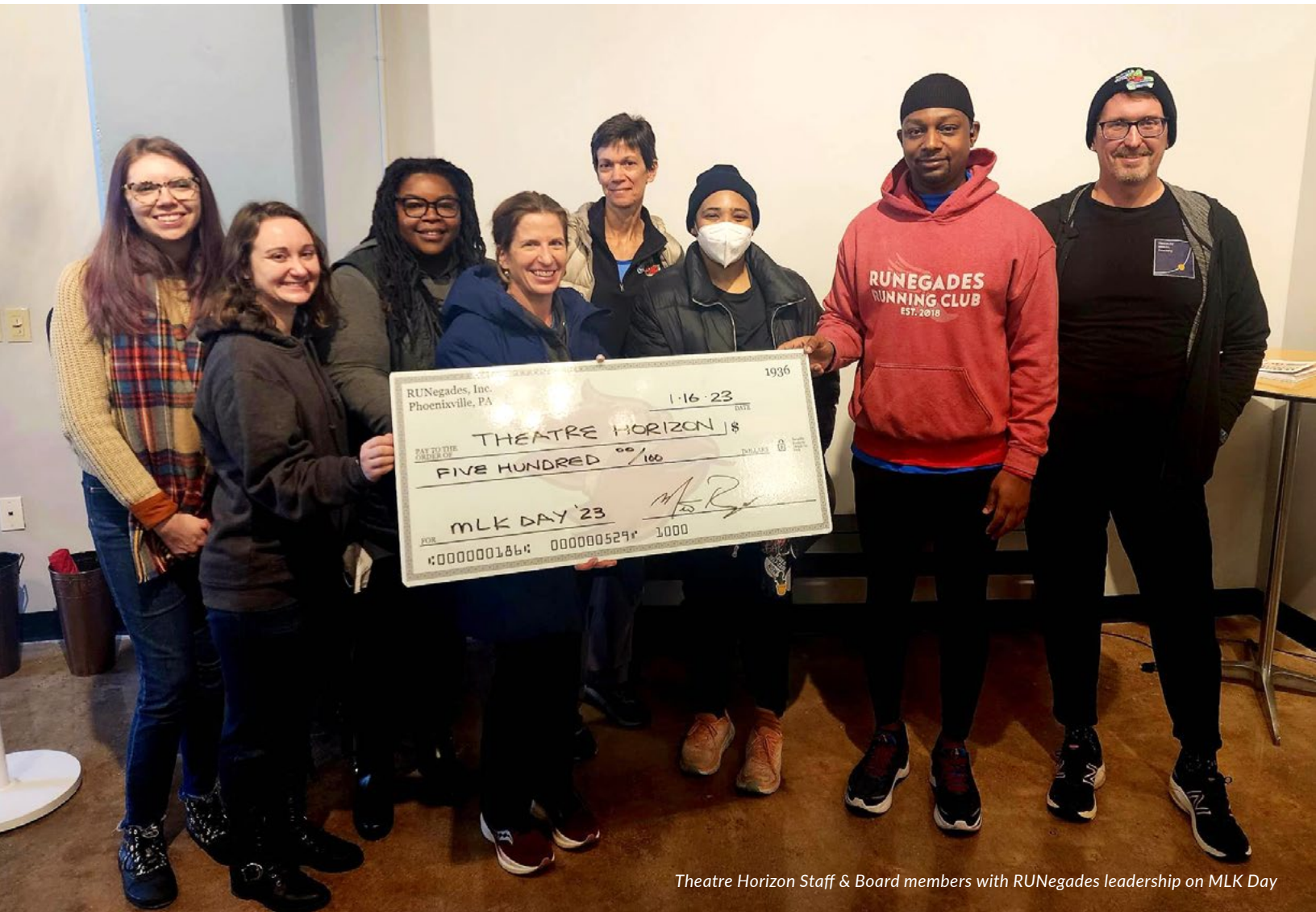
Theatre Horizon Staff & Board members with RUNegades leadership on MLK Day